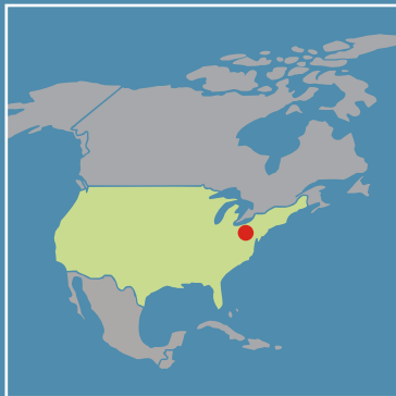
Syracuse, NY, USA